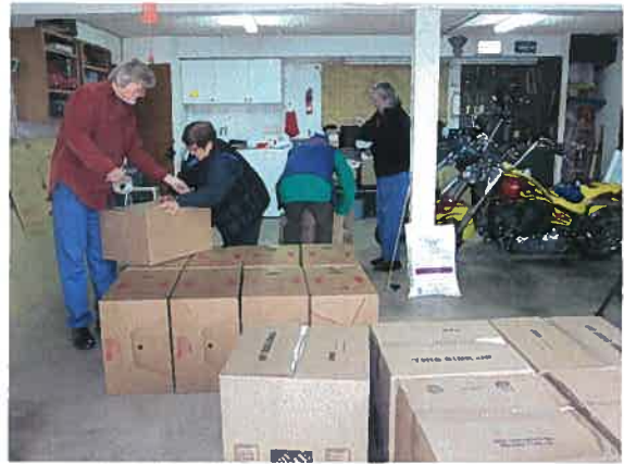
Building the float in the Crandall's garage