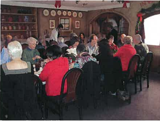
More members having lunch and conversing