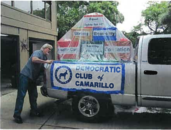
Loading the float, in the rain