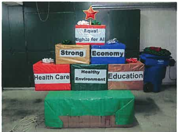
Finished product before loading