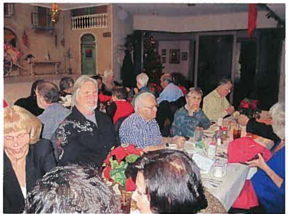
Members having lunch and having fun!